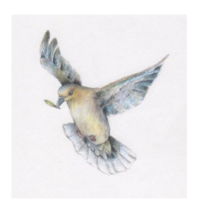
But I am loyal and gracious to the thousandth generation of those who love me and keep my commandments. Exodus 20:6 CEB

• In Psalm 128, God's Word reveals the relationship between a person's faith and the blessing that comes to their family and succeeding generations. Spend time in prayer for your descendants, even if you don't have a spouse or children yet: